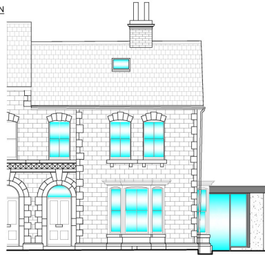
AS PROPOSED WEST ELEVATION (Scale 1:50)