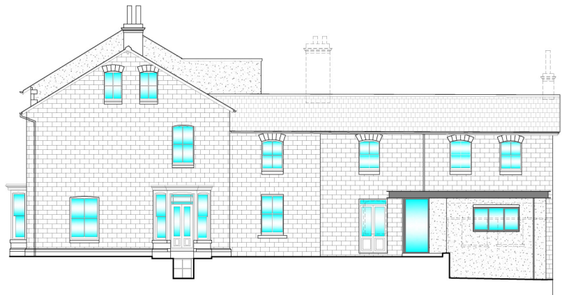
AS PROPOSED SOUTH ELEVATION (Scale 1:50)